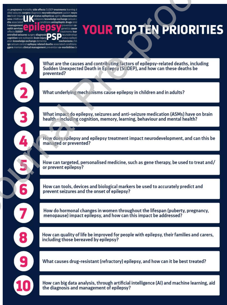
Figure 3: UK Epilepsy PSP Top Ten priorities for research into epilepsy.