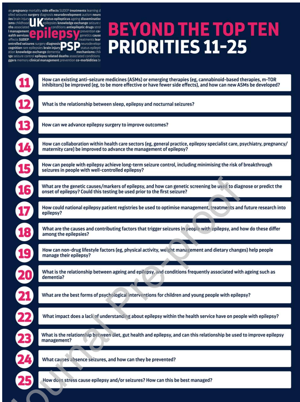
Figure 4: UK Epilepsy PSP priorities ranked 11-25 for research into epilepsy.