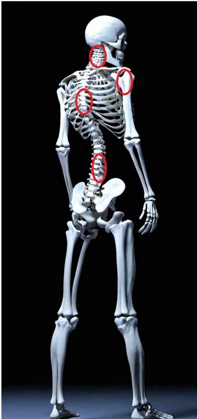
Fig. 4. General surgeons' work-related musculoskeletal injuries common body sites (OpenArt AI used to create this figure).