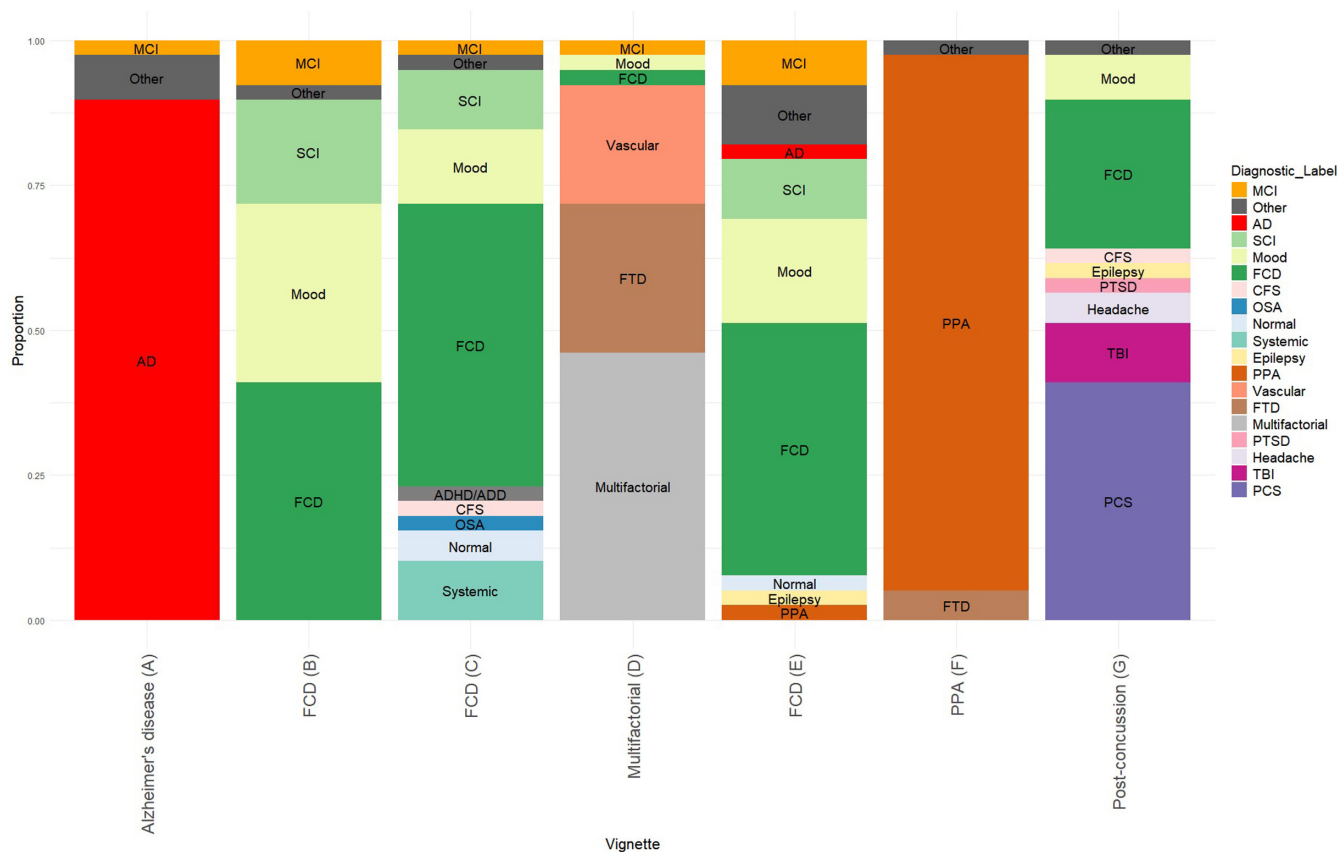
FIGURE 2 Diagnostic labels for each clinical scenario. Research study reference diagnoses are named under each bar. AD, Alzheimer's disease; CFS, chronic fatigue syndrome; FCD, functional cognitive disorder; FTD, frontotemporal dementia; MCI, mild cognitive impairment; OSA, obstructive sleep apnea; PCS, 'post-concussion syndrome'; PPA, primary progressive aphasia; PTSD, post-traumatic stress disorder; SCI, subjective cognitive impairment; TBI, traumatic brain injury.

for FCD was 3–4, with blood tests, MRI scan and neuropsychological evaluation leading the preferences. Neurologists were more likely to ask for a CSF study ( p < 0.001 ), but not other tests, in comparison with non-neurologists.