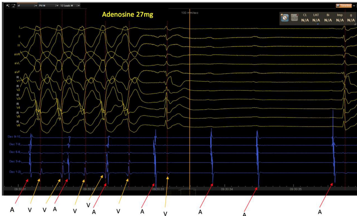
Fig. 2. Intracardiac electrogram recordings during intravenous adenosine administration - a decapolar catheter (placed via right femoral vein access in the cardiac catheter laboratory) recording electrical signals is placed in the coronary sinus which records the local atrial signal from five poles (labelled 'A') and the far-field ventricular signal (labelled 'V'). During the broad complex tachycardia, there is clear evidence of A-V dissociation, which proves that the diagnosis is ventricular tachycardia. Following administration of IV adenosine, there is a period of AV block and termination of tachycardia where only local atrial signals are recorded on the decapolar catheter (note P-waves on surface ECG with no QRS complexes during AV block).