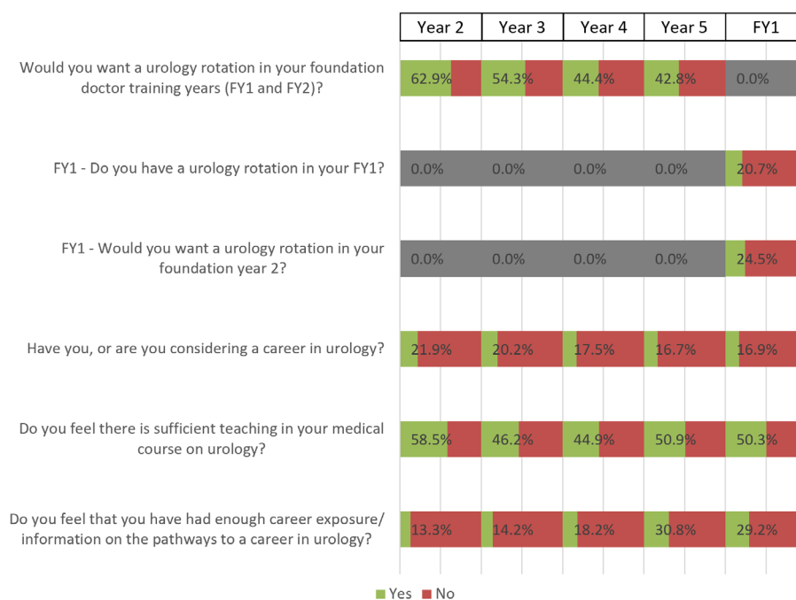
Fig. 3 Postgraduate career and exposure, stratified by year group. Percentage (%) corresponds to the 'Yes' value.

17.3% of all Year 2 to Year 5 medical students and FY1 doctors collectively (7063/40 927). In addition, representation was achieved across all 39 eligible UK medical schools. This enabled us to capture the heterogeneity in placement exposure, both across and within UK medical schools. To our knowledge, this is the largest study on specialty-specific undergraduate teaching. We did not find any comparable large-scale evidence on urology education during medical school in other countries. This makes the LEARN the only study worldwide to investigate this and serves as a good baseline for other countries to investigate their undergraduate urology exposure. Additionally, there was no strong evidence to suggest significant variation in results between medical schools based on the number of responses (Fig. S18). Medical schools with a greater number of responses tended to fall within a reasonable difference to the national average, whilst medical schools with a lower number of responses were at risk of over-estimating urological exposure.