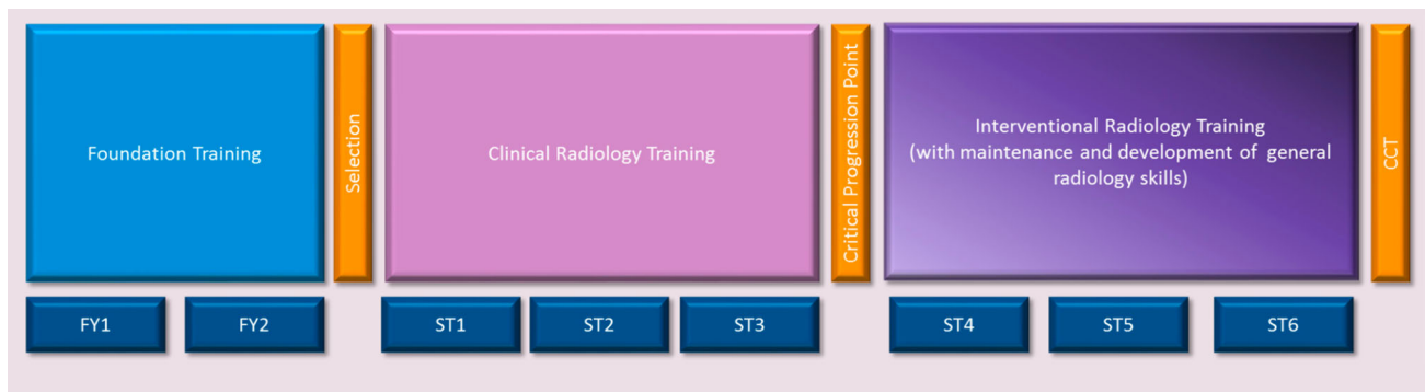
Fig. 1 Training pathway for interventional radiology