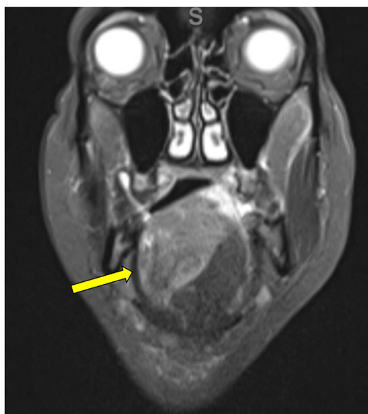
Figure 1. MRI of the skull base and neck performed 11 months after onset showing a neoplastic lesion of the tongue.

Our examination in November 2021 disclosed the following findings (Video 1): inability to mobilize the tongue, dysarthria, and nasal voice with no effect of distractive maneuvers. Upon touching the tongue, the tissue was indurated and had pain and resistance to passive manipulation. No ulcers or leukoplakia were noted.