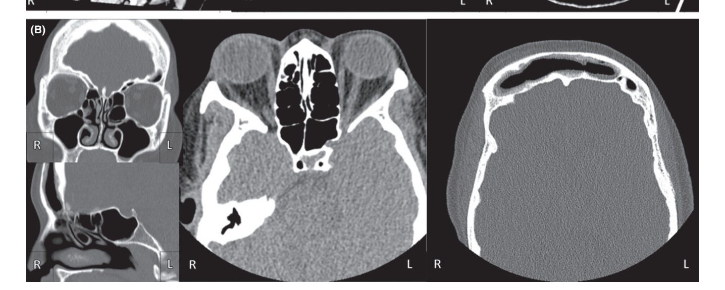
FIGURE 2 CT Imaging. (A) Unenhanced CT Orbit with contrast prior to surgery. Sagittal, coronal, and axial views show an expanded and markedly enlarged frontal sinus with mucosal thickening (arrow) and swelling of the soft tissues overlying the orbit and forehead. There is a destruction of the right lamina papyracea anteriorly. The frontal sinus and anterior ethmoid air cells were completely opacified and a low-density collection is seen eroding through the lamina papyracea into the superior aspect of the orbit causing superio-posterior globe indentation and proptosis. There is an extraconal low-attenuation collection displacing the extraocular muscles and retrobulbar fat. There is no intracranial extension of the mucocele. (B) CT unenhanced orbit at 3 months follow-up. The mucocele has been drained and there is no sign of re-stenosis. Proptosis has largely resolved. Minimal thickening of soft tissues anteriorly over the surgical defect.

highly morbid if left untreated, posing a risk of intraorbital infection and associated intracranial complications, such as meningitis, subdural abscess, intracerebral abscess, and osteomyelitis. In this case, the patient presented late with irreversible vision loss due to compressive ischemic optic neuropathy, demonstrating the need for diagnosis and early operative intervention where frontal sinus disease is suspected.