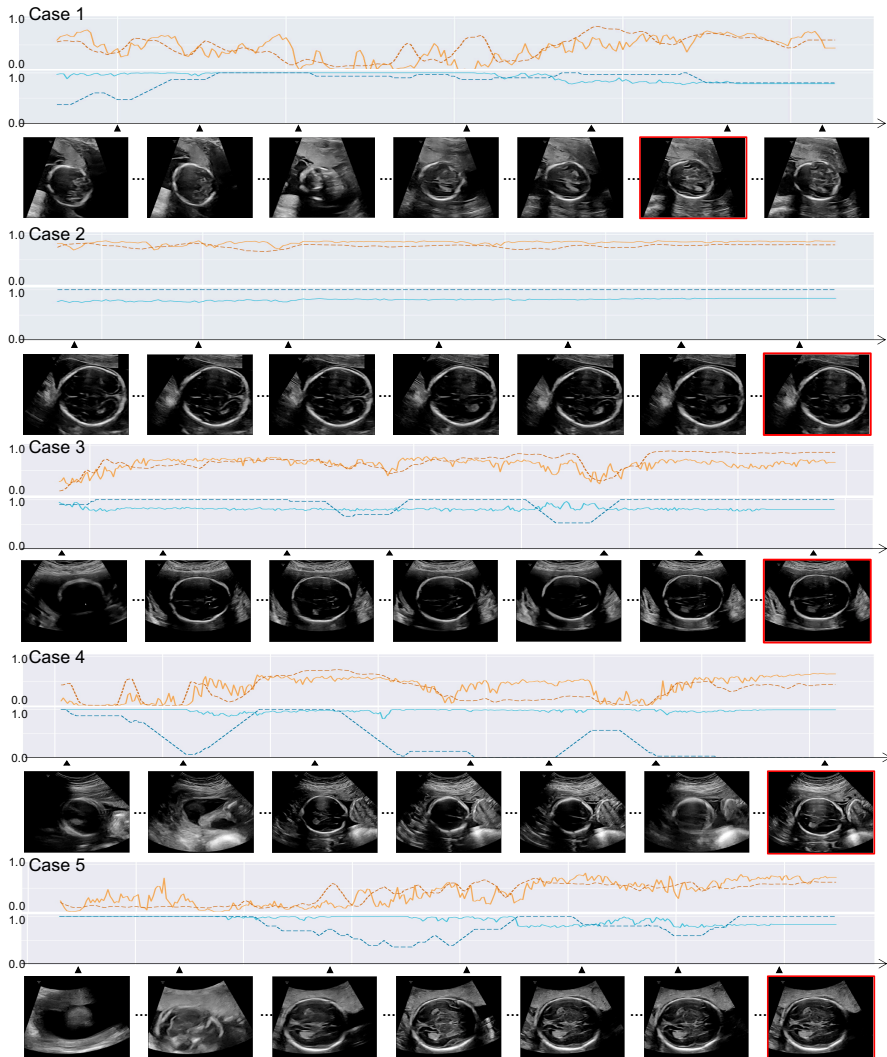
Fig. 2 Additional cases complementing the Section 4.4 and Figure 2 in the main paper. f_{skill}^{pos} and f_{skill}^{acc} are plotted in orange and blue, respectively, with both task model-generated scores and the predicted scores in dotted and solid lines, respectively. The red boxed frames were the manually identified standard planes.