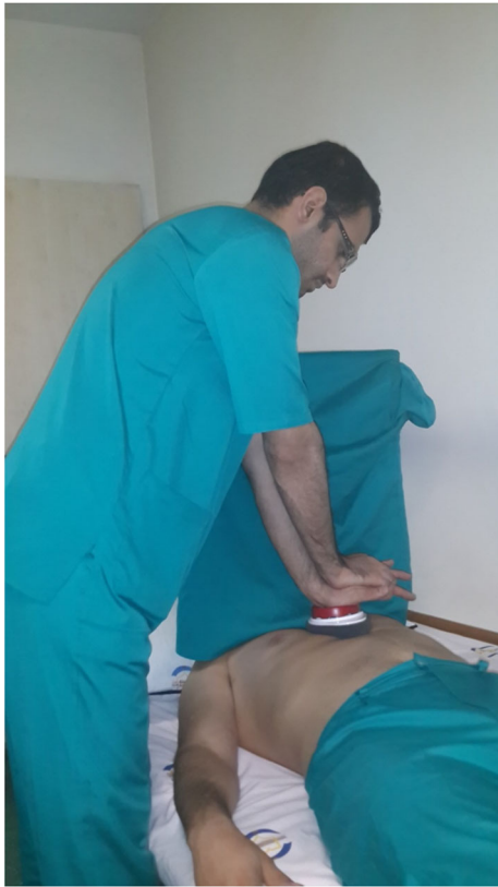
Figure 2 Pictogram for displaying the proper use of the device.

received, sex, age, intubation prior to CPR initiation, intubation during CPR, multi-organ dysfunction (respiratory, haematology, liver, cardiovascular, central nervous system, and renal), CPR shift, CPR duration, initial rhythm, first shock, biphasic shock, diagnosis, underlying osteoporosis, and frequency of conducted CPR. There were no important changes to methods after trial commencement. Information for invasive arterial monitoring and capnography wave was not reported as these procedures are not commonly available for patients.