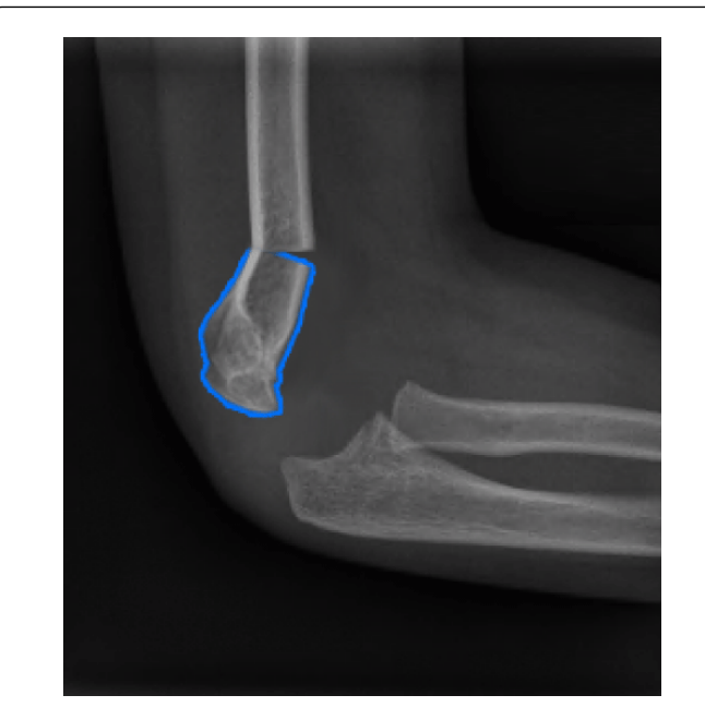
Figure 2: Supracondylar fracture Gartland 2.

Any useful classification system should have strong inter and intraobserver reliability [8], provide basic treatment guidelines, and help to predict outcome. It has been suggested that the Wilkins modification of the Gartland classification showed poor inter-observer reliability for type I fractures, fair to moderate reliability for type II fractures and very good reliability for type III fractures. An analysis by Flierl et al. [9] examined the relationship between coronal fracture displacement and rotational mal-alignment with adverse outcomes. This retrospective review analysed three morphological characteristics on preoperative radiographs from 373 patients. Rotation and coronal displacement patterns were found to be significantly associated with postoperative complications, residual stiffness and nerve injury. The analysis concluded that posterolateral displacement and fractures with rotational deformity were associated with a higher rate of postoperative complications, a greater need for physical or occupational therapy and nerve injury. These findings allow the treating surgeon to anticipate potential complications. Heal et al. [10] also established that treatment should be according to the degree of displacement.