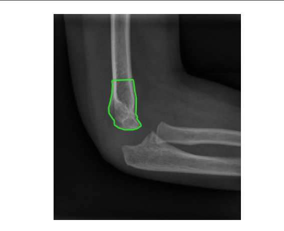
Figure 1: Supracondylar fracture Gartland 1.

Gartland classified supracondylar fractures in 1959 [5], with a classification system that differentiates extension supracondylar fractures according to the degree of displacement of the distal fracture fragment; Type I is undisplaced or minimally displaced (Figure 1), Type II is displaced but incomplete with an intact posterior cortex (Figure 2). There may also be coronal angulation and medial column disruption. In 1984, Wilkins [6] modified Gartlands' classification specifically with reference to type II and III fractures.