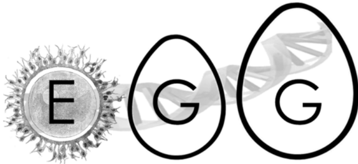
Figure 1. Logo's