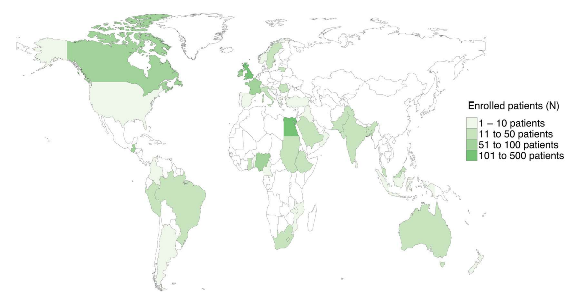
Figure 1 World map showing participating countries and number of enrolled patients.

Data were selected to be objective, standardised, easily transcribed and internationally relevant, in order to maximise record completion and accuracy. Recruited patients were followed up to day 30 after surgery or for the length of their inpatient stay where follow-up was not feasible. Records were uploaded by local investigators to the secure online REDCap website. The lead investigator at each site validated all cases prior to data submission. The submitted data were then checked centrally and where missing data were identified, the local lead investigator was contacted and requested to complete the record. Once vetted, the record was accepted into the data set for analysis.