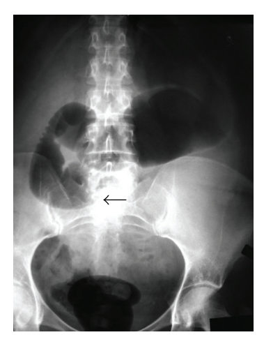
FIGURE 1: Abdominal X-ray demonstrating abrupt cut off sign at the 3rd portion of duodenum. Dilated stomach and proximal duodenum. Black arrow shows the cut-off sign.