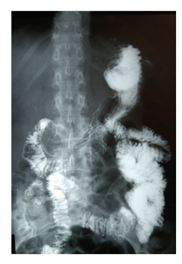
FIGURE 3: Upper GI shows the relief of obstruction by contrast moving distally, once the patient was placed in prone position.

During her surgical follow-up visit she continued to complain of postprandial pain with an early satiety and episodic nausea. She appeared weak and malnourished. She noted a 20 lbs weight loss since her initial antireflux procedure. Her abdomen was slightly distended with hyperactive