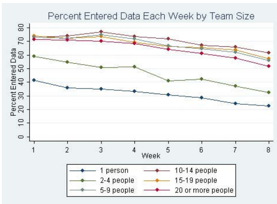
Figure 2 Percentage of participants entering data per week by team size.

in a short period of time using a targeted, large-scale advertising campaign. Because enrollment was limited to a well-defined population, it was possible to calculate the percentage of eligible participants who enrolled and succeeded in the program. Of the 47,074 eligible participants, approximately 16% registered with the site.