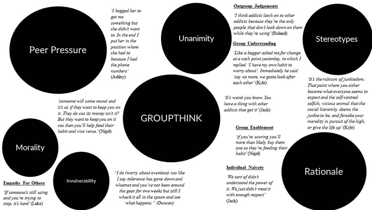
Figure 1. The deductive Groupthink themes of heroin use and subthemes. Groupthink appeared in the majority of interviews. The above circle size denoting prevalence within the interview set.

a lot of times and people don't really like to see, mainly people who use heroin they don't want you to stop. They try to say 'go on, have a little bit it'll make you feel better'