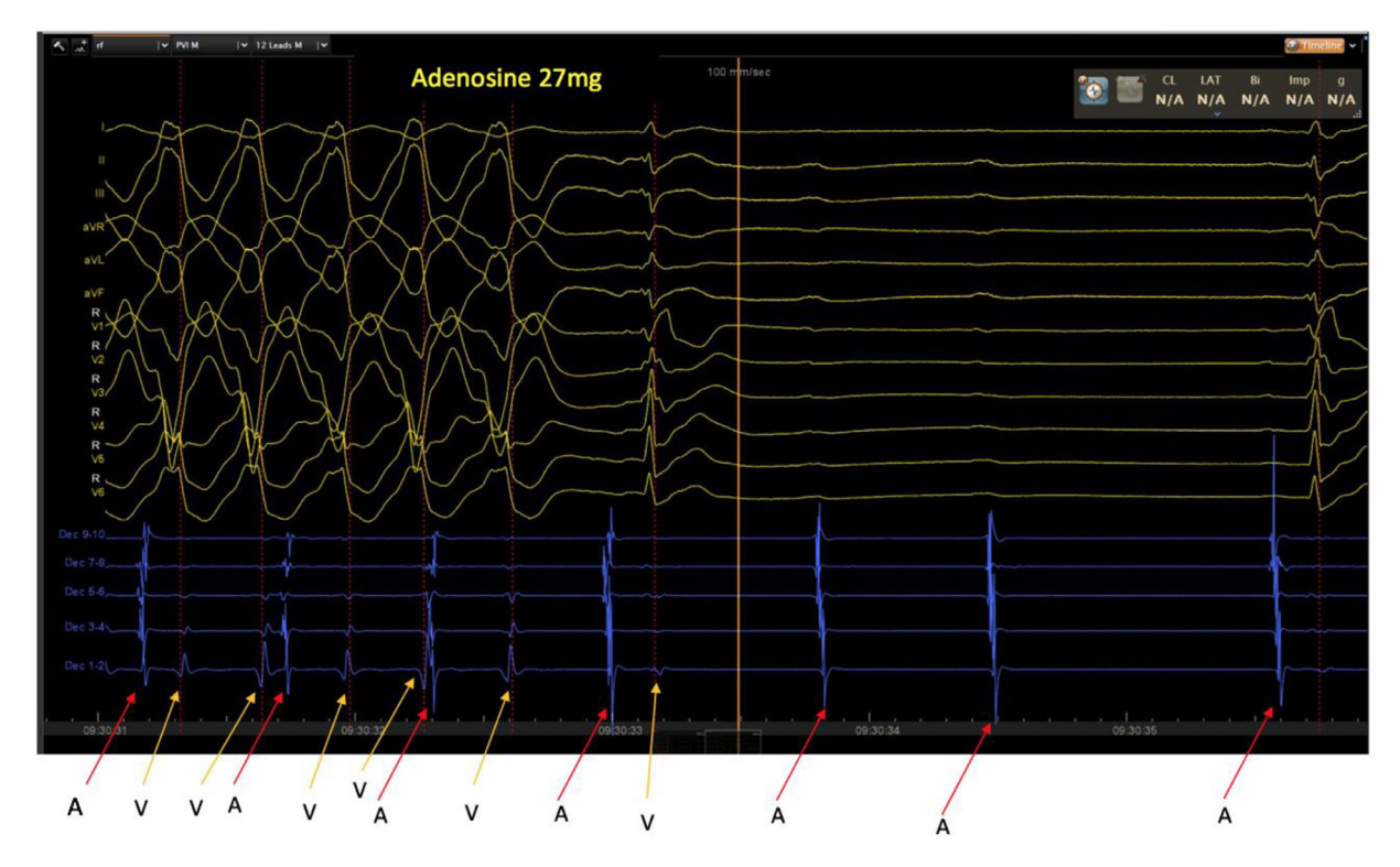
Fig. 2. Intracardiac electrogram recordings during intravenous adenosine administration - a decapolar catheter (placed via right femoral vein access in the cardiac catheter laboratory) recording electrical signals is placed in the coronary sinus which records the local atrial signal from five poles (labelled 'A') and the far-field ventricular signal (labelled 'V'). During the broad complex tachycardia, there is clear evidence of A–V dissociation, which proves that the diagnosis is ventricular tachycardia. Following administration of IV adenosine, there is a period of AV block and termination of tachycardia where only local atrial signals are recorded on the decapolar catheter (note P-waves on surface ECG with no QRS complexes during AV block).