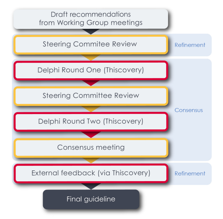
Figure 2. Translating draft recommendations from working groups into a final clinical practice guideline. Draft statements from working group meetings will be prioritised for inclusion in final guideline through an online Delphi consensus-building exercise, selection and finalisation by the ICENI steering group (yellow boxes), and a subsequent feedback and refinement on implementation and feasibility from external stakeholders. Red boxes indicate use of the Thiscovery platform.

Draft recommendations will then be subjected to a two-step process of refinement before being considered as part of a formal consensus process (Figure 2). The first of these stages will be a review of each recommendation and its evidence by the steering committee, mainly focused on ensuring that each recommendation is within the scope of the process