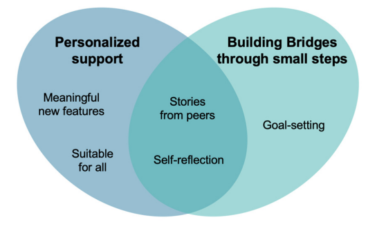
Figure 2. Thematic analysis: themes and sub-themes.

Two major themes were derived from the data analysis: (i) "personalized support" and "building bridges through small steps", which represented the importance of meaningful information and collaborative strategies to overcome the challenges and difficulties after a stroke. Each theme was connected to sub-themes, as presented in the Venn diagram (Figure 2), and described below in further detail. For each sub-theme, quotes are included with the identification of the participant's group (PwS—people with stroke; C—caregiver; HP—health professional).