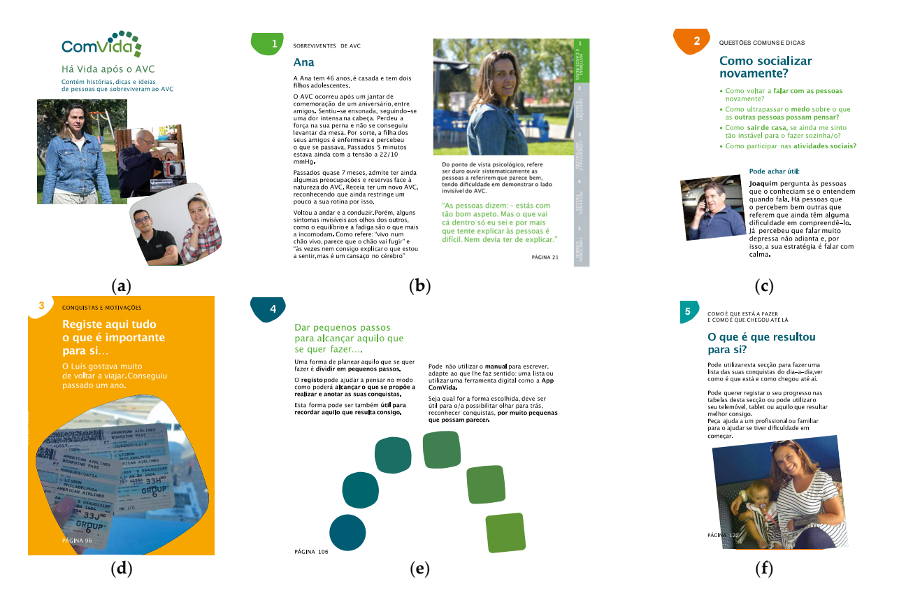
Figure 3. Illustrative examples of the ComVida workbook. ( a ) Cover of the workbook; ( b ) Peers stories: the story of Ana, 46, who suffered a stroke that affected her balance (chapter 1); ( c ) Common questions and tips: "how to socialize again?", including strategies people with stroke found useful (chapter 2); ( d ) Hopes and ideas, giving examples and space for people to write their hopes for the future (chapter 3); ( e ) Small steps and taking action: set goals (chapter 4); and ( f ) Looking back: with a list of achievements that have worked for Diana (chapter 5).