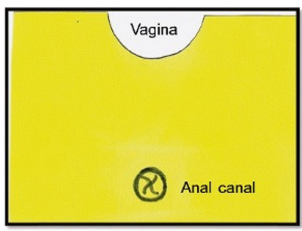
A. Paper replica of the episiotomy training pad

The corresponding author conducted a series of workshops in India as part of the RCOG Sims Black Travelling Professorship award in 2022, with the aim of sharing knowledge in the prevention and repair of OASIs. Doctors from three units in New Delhi, Chennai and Pondicherry were included. The aim of this study was to audit the practice of mediolateral episiotomy in India. Participation in this audit was voluntary. A standard questionnaire was completed by participants prior to the commencement of the workshop. Information gathered included age, gender, height and years of practice since completion of training in obstetrics. Participants were asked to describe the recommended episiotomy angle and the angle was to be drawn on a paper replica of the perineum as described by Naidu et al. [10] (Fig. 2). A right or left cut could be drawn in keeping with the participants' preference. N.A.O manually measured each episiotomy using a protractor. As this was an audit of clinical practice amongst clinicians, ethical approval and written consent was not required.