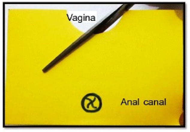
B. An episiotomy being made at 60 degrees