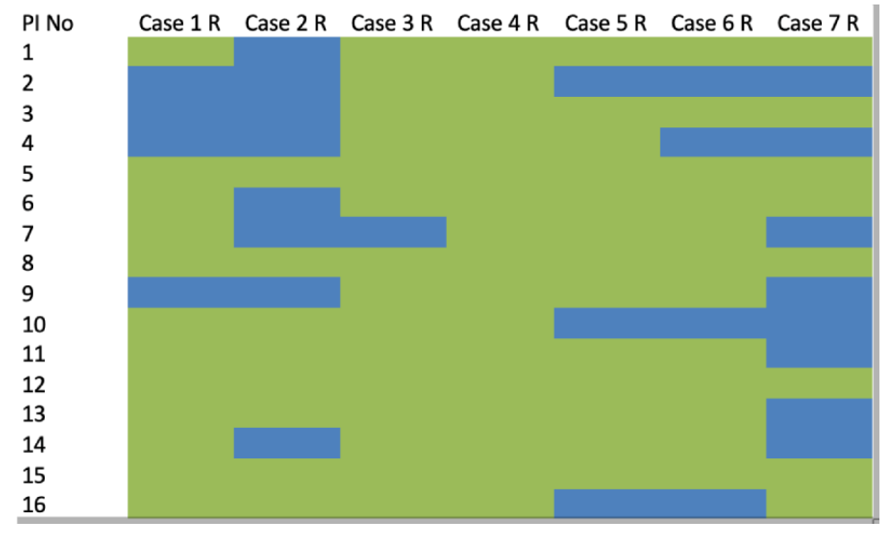
Figure 1. Heatmap showing investigator replies in relation to the chosen surgical approach from the case vignettes. Green represents posterior approach and blue represents anterior approach. No: number; PI: principal investigator.

had more than 10 years of experience (Figure 1). After collating the number of PIs (n=16), we explored their decision-making according to each case vignette (n=7), which resulted in 112 entries with problem-specific data. Overall, investigators favored a posterior approach (84/112, 75%) with instrumentation (79/112, 66%) but would randomize most of the cases (67/112, 62%), which is felt sufficient for the purposes of the trial.