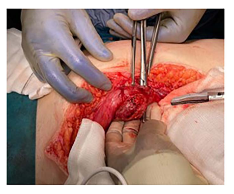
Figure 4. Umbilicus and abdominal wall following resection of MD.

urachal abnormalities, including a patent urachus, umbilicalurachal sinus, urachal cyst and alternating sinus [4]. Possible complications of vesicourachal diverticuli include spontaneous or traumatic rupture, recurrent infection (as with our patient) and stone formation [4]. Vesicourachal diverticuli tend to present clinical issues for adults rather than children [4], and diagnosis can be made by CT imaging as well as a voiding cystourethrogram and cystoscopy [4].