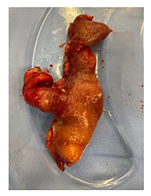
Figure 2. Resected specimen—small bowel with MD—resected from adherent umbilicus.

preperitoneal tissue was resected and sent for histology. The patient's post-operative period was complicated by small intraabdominal collections, which were managed conservatively with antibiotics. The patient was discharged eleven days after admission.