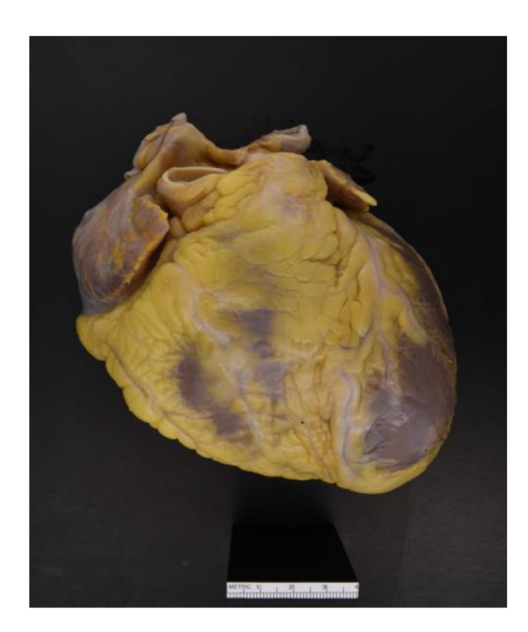
Fig. 1. External anterior surface of the heart prior to dissection. The heart is positioned in the correct anatomic position.