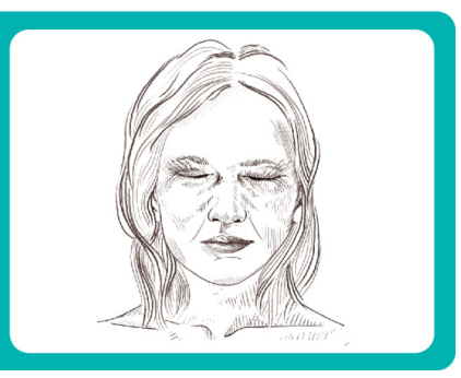
Fig 1 | Different clinical patterns of isolated dystonia. Children and adolescents typically present with a generalised dystonia whereas presentation in adults is usually with a focal dystonia

Patients frequently report a gritty or uncomfortable feeling in the eyes before onset of spasm in orbicularis oculi muscles