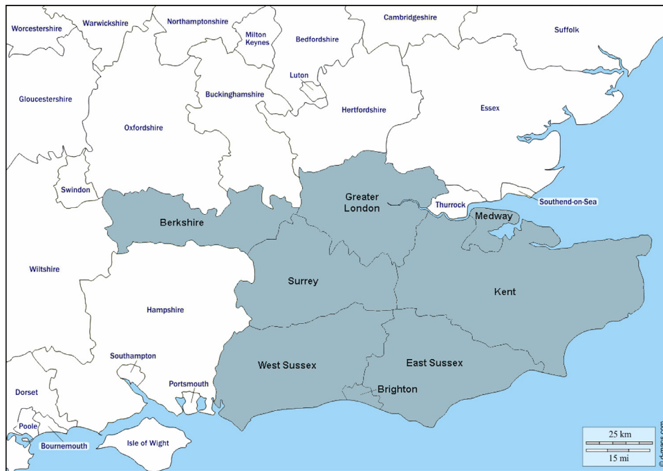
Fig. 1. Catchment area of London Thoracic Surgical Centres. Dark grey area denotes regions covered by the pan London collaborative.