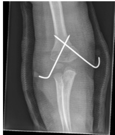
Fig. 4 Crossed wires used to stabilise a high medial (reverse oblique) fracture pattern

Larger diameter wires offer increased stability, in particular in the sagittal plane [61, 78–80] without increased risk of iatrogenic ulnar nerve injury [78, 80]. The British Orthopaedic Association Standards for Trauma (BOAST) supports using 2 mm wire diameter, to improve stability [81].