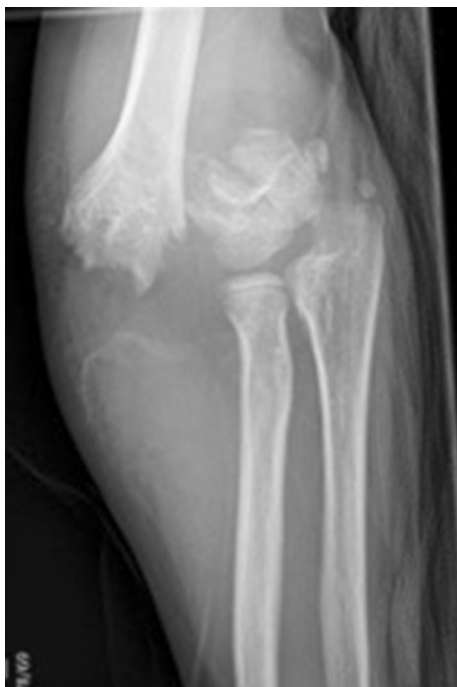
Fig. 5 Gartland III (AO 4) injury with posteromedial displacement

Traumatic neurapraxia is regularly associated with supracondylar fractures, with a reported rate of 11.3% [33]. The anterior interosseus nerve (AIN) is most commonly injured however incidence varies with injury type. The median nerve, and in particular, the AIN is most frequently injured following extension-type fractures (34.1% of associated neuropathies), whilst the ulnar nerve is more commonly associated with the less common flexion-type fractures (91.3% of associated neuropathies) [33, 88–91] and is likely to be