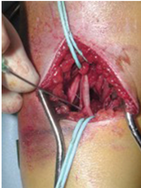
Fig. 6 Exploration of the brachial artery and median nerve for neurovascular injury

of 48 h but three patients, who underwent urgent exploration, did not develop a contracture. Late exploration was performed in 21 cases and identified entrapment of the vessel within the fracture site in nine and constriction by scar tissue in 12, decompression returned pulsatile flow in all cases [95].