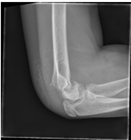
Fig. 3 Flexion type supracondylar fracture

There is a lack of good quality evidence on the management of these injuries. Manipulation and casting in extension have been shown to give good results [59], although can be poorly tolerated. Closed reduction and percutaneous pinning are usually necessary but open reduction may be necessary [12, 56–58, 60].