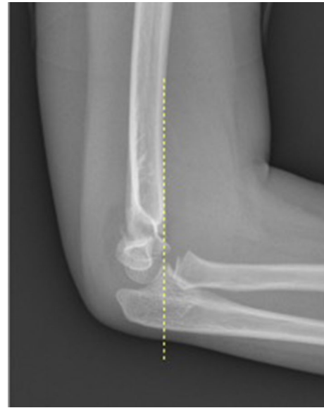
Fig. 2 Anterior humeral line (AHL, yellow dotted line) passing in front of the capitellum suggesting posterior/extension displacement of the distal humerus

At birth, the distal humeral epiphysis is wholly cartilaginous, with the capitellar ossification centre appearing at age one year [38], making the diagnosis of supracondylar fracture difficult in the very young. The order of appearance and fusion of the ossific centres of the distal humerus is consistent and reliable between individuals [39] and AP and