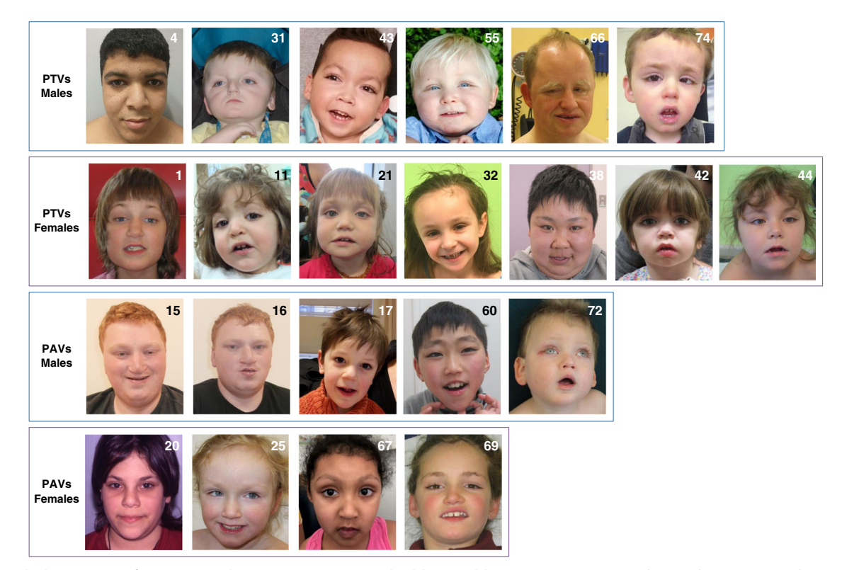
Fig. 2 Facial phenotypes of patients with KDM6A variants are highly variable. Patients are grouped according to sex and type of variant. Most patients have arched eyebrows, long palpebral fissures, some eversion of the lateral part of the lower eyelids, and bulbous or rounded nasal tip. Unlike the classical gestalt of Kabuki syndrome, the eyebrows are interrupted in only some patients, and are thick in many (P4, 11, 60, 66, and 67) or thin and penciled occasionally (P1, 72). Lateral flaring of eyebrows is observed in some patients (P11, 67, 69, and 74). Ears are not simple or as prominent as usually seen in patients with classic Kabuki syndrome. In several patients they appear relatively large and rather fleshy. Prominent lower lips or pillowing of the lower lips was observed in some patients (P11, 21, 42, 44, 60, 67, and 74). Prominent forehead was observed frequently. Patient 20 inherited the p.Ala149Thr variant form her father, who is similarly affected. PAV protein-altering variants, PTV protein-truncating variants.