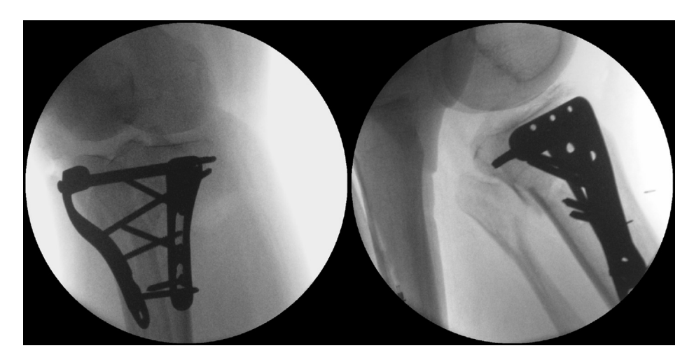
Figure 4. Patient 2 Anterior-posterior (AP) and lateral image intensifier intraoperative projections.

Both patients achieved clinical and radiological union by 3 months follow-up. There were no infections in either patient and all wounds healed well with minimal scar formation (Figure 5). At 2-year follow-up Patient 1 continues to mobilise pain-free without the use of mobility aids. There is minimal residual scarring (Figure 6). The patient is able to flex her knee to over 110° (Figure 7). Weight-bearing radiographs at 2 years show good preservation of the femorotibial joint space (Figure 8).