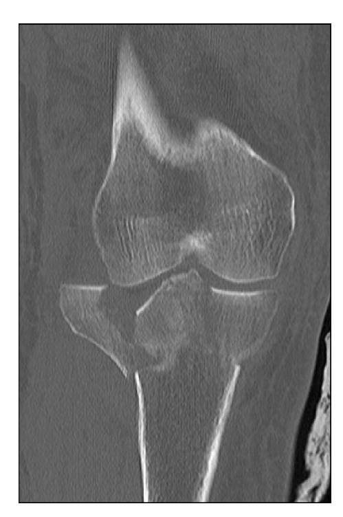
Figure 1. Coronal CT scan of right knee of Patient 1 showing OTA Classification 41-C3 tibial plateau fracture. CT = computed tomography; OTA = Orthopaedic Trauma Association

A 66-year-old female presented having fallen from standing height while walking. She had a background of asthma, herpes simplex, and a previously perforated gastric ulcer. She consumes