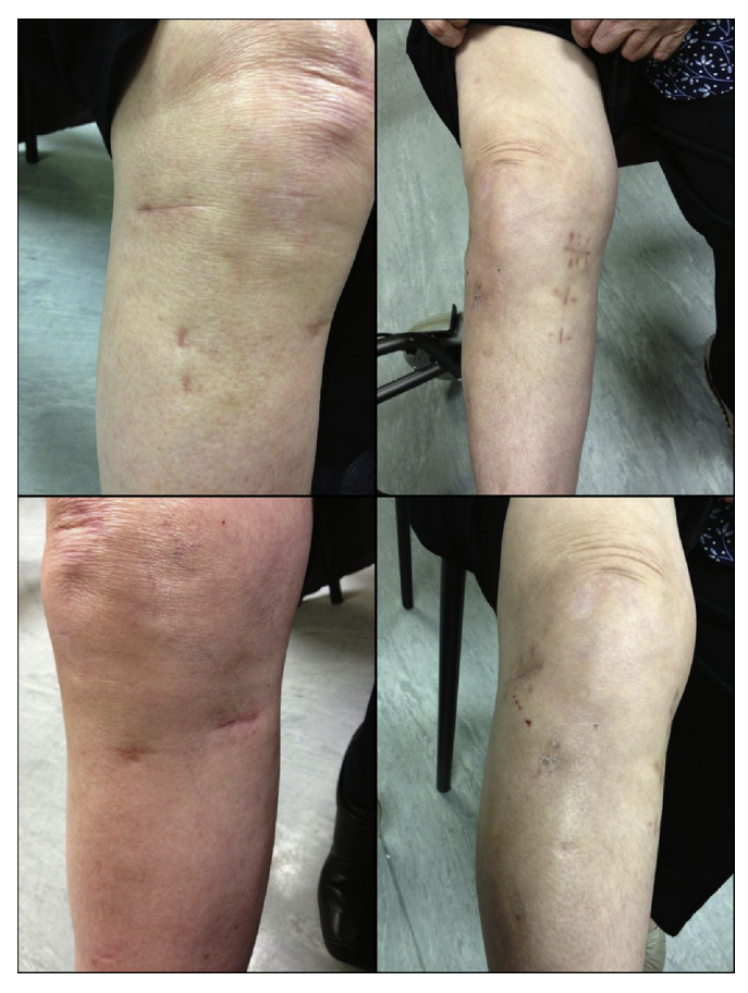
Figure 5. Healed wounds at 3-month follow-up with minimal scar formation.

particularly between long longitudinal incisions is at risk of avascular necrosis and its sequelae. Our technique utilises short transverse incisions relatively far from the midline. This should reduce the risk of wound complications when subsequent arthroplasty is performed through a longitudinal midline incision.