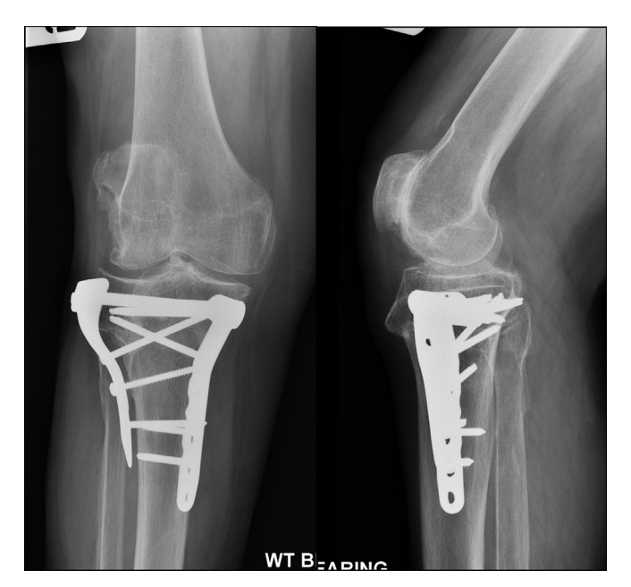
Figure 8. Patient 1 Anterior-posterior (AP) and lateral radiographs at 2-year follow-up.

We believe our approach to these fragility fractures to be safe, reliable, and reproducible, and ideal when alignment restoration with early patient mobilisation and rehabilitation is the goal. This is hugely significant in the context of providing a bone and soft tissue "canvas" for future arthroplasty.