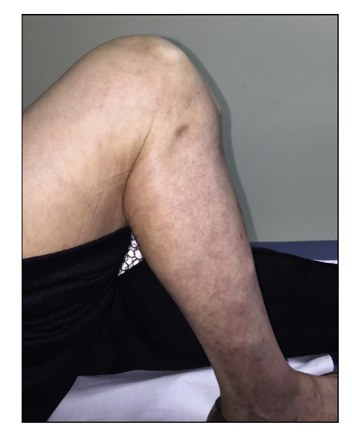
Figure 7. Patient 1 with active flexion to over 110° at 2-year follow-up.

Traditional approaches to the medial or lateral tibial plateau, whether open or minimally invasive, are orientated in the longitudinal plane. This contrasts against the basic surgical principle of orientating incisions where possible along the direction and orientation of collagen fibres in the dermis of the skin, originally described in German by Langer<sup>10</sup> in 1861, and translated to English in 1978. Our transverse incision technique is given further credence by the words of Hoppenfeld<sup>11</sup> when he reports that "The lines of cleavage of the skin run roughly transversely across the knee joint. Therefore, the more the transverse the incision, the more cosmetic the resulting scar."