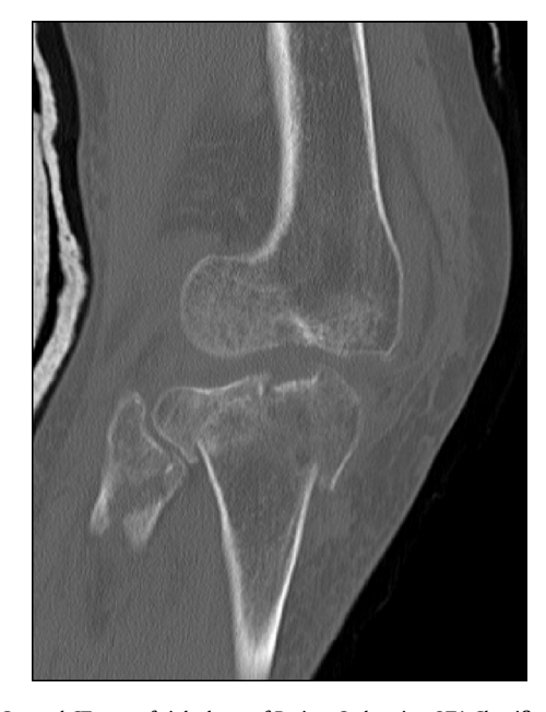
Figure 2. Coronal CT scan of right knee of Patient 2 showing OTA Classification: 41-C3 tibial plateau fracture. CT = computed tomography; OTA = Orthopaedic Trauma Association.

Both patients were allowed full free range of motion immediately postoperatively. Toe-touch weight bearing was permitted from the 1<sup>st</sup> day, with increase to partial weight bearing at 4 weeks, and full weight bearing by 6–8 weeks.