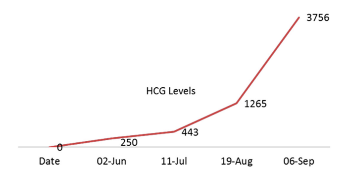
Figure 1 Graph: Increasing HCG level.

(hCG) which is secreted in excessive amounts and usually serves as a key marker for diagnosis as in our patient (Fig. 1). It is also utilized as a prognostic marker and to monitor response to treatment. The origin of the tumor is uncertain. One explanation is the testicular origin with metastasis to the mediastinum and subsequent involution and regression of primary testicular tumor before the diagnosis (4, 5). It is, however, challenged by the fact that testicular tumors usually metastasize to retroperitoneal nodes initially, bypassing mediastinum. Another widely accepted explanation is entrapment of germ cells arising from the mesothelium of primitive gonads or yolk sac endoderm along the urogenital ridge which remains dormant and only manifests in malignant form by stimulation after puberty (6, 7). Detailed and extensive search for primary origin should be conducted with the main focus on gonads before making a diagnosis of primary mediastinal choriocarcinoma. The classic triad of chest pain, cough and fever is described