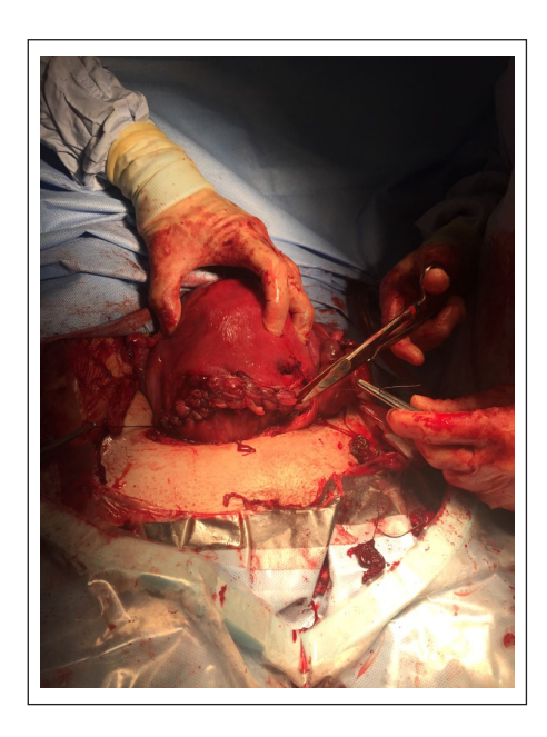
Figure 4. Second-layer closure of the myometrial defect. Note the use of three 'box sutures' with a 110-mm needle to close the first layer without tension, prior to continuous second-layer closure.

(unpublished data from the authors). In contrast, peripartum hysterectomy has been associated with significant maternal morbidity and mortality, which include massive blood loss, which may exceed 10,000 mL in up to 13% of patients.<sup>20</sup> Injury to adjacent organs such as the urinary bladder may occur in up to 6%–29%<sup>21,22</sup> and injury to the ureters in up to 7% of cases.<sup>23,24</sup> The maternal mortality rate has been reported to be of 1%–6%.<sup>23–26</sup> It is important to note that bladder injury remains a risk even in interval hysterectomy, and it has been reported that intentional cystotomy and a partial cystotomy may be required in up to 33% of cases of delayed or interval hysterectomy.<sup>27</sup>