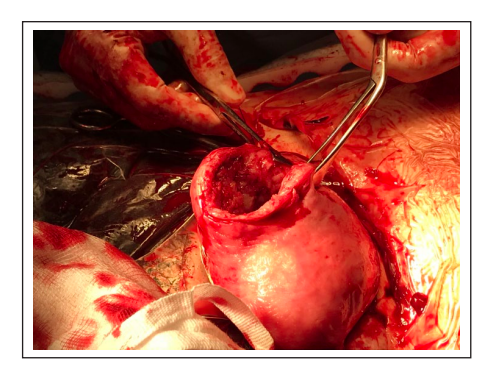
Figure 7. Myometrial excision of area of placental invasion in the upper segment after bilateral ligation of uterine arteries.

without adjacent organ involvement), surgical and anaesthetic expertise available, resources (i.e. facilities for blood transfusion, interventional radiology) as well as the woman's choice for future fertility. Irrespective of the surgical technique of choice, women with a high suspicion or confirmed abnormally invasive placenta should be managed in a specialist centre with surgical expertise with a multi-disciplinary team who is experienced in managing these complex cases with an immediate availability of blood products, interventional radiology service, an intensive care unit and a neonatal intensive care unit to optimize the outcomes.