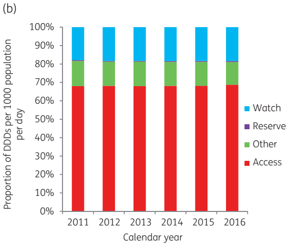
Figure 1. (a) Antibiotic consumption in England (primary and secondary care) as DDDs per 1000 population per day by WHO AWaRe category. (b) Proportion of antibiotic DDDs per 1000 population per day in England (primary and secondary care) by WHO AWaRe category. Other, antibiotics not included in the WHO AWaRe index. This figure appears in colour in the online version of JAC and in black and white in the print version of JAC .