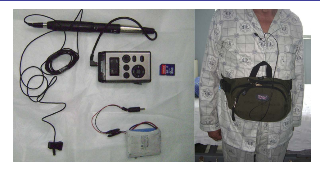
Figure 2 Picture of the Cayetano Cough Monitor (CayeCoM).

algorithm. On the basis of classifier outputs, each acoustic event will be marked as 'cough' or 'not-cough'.