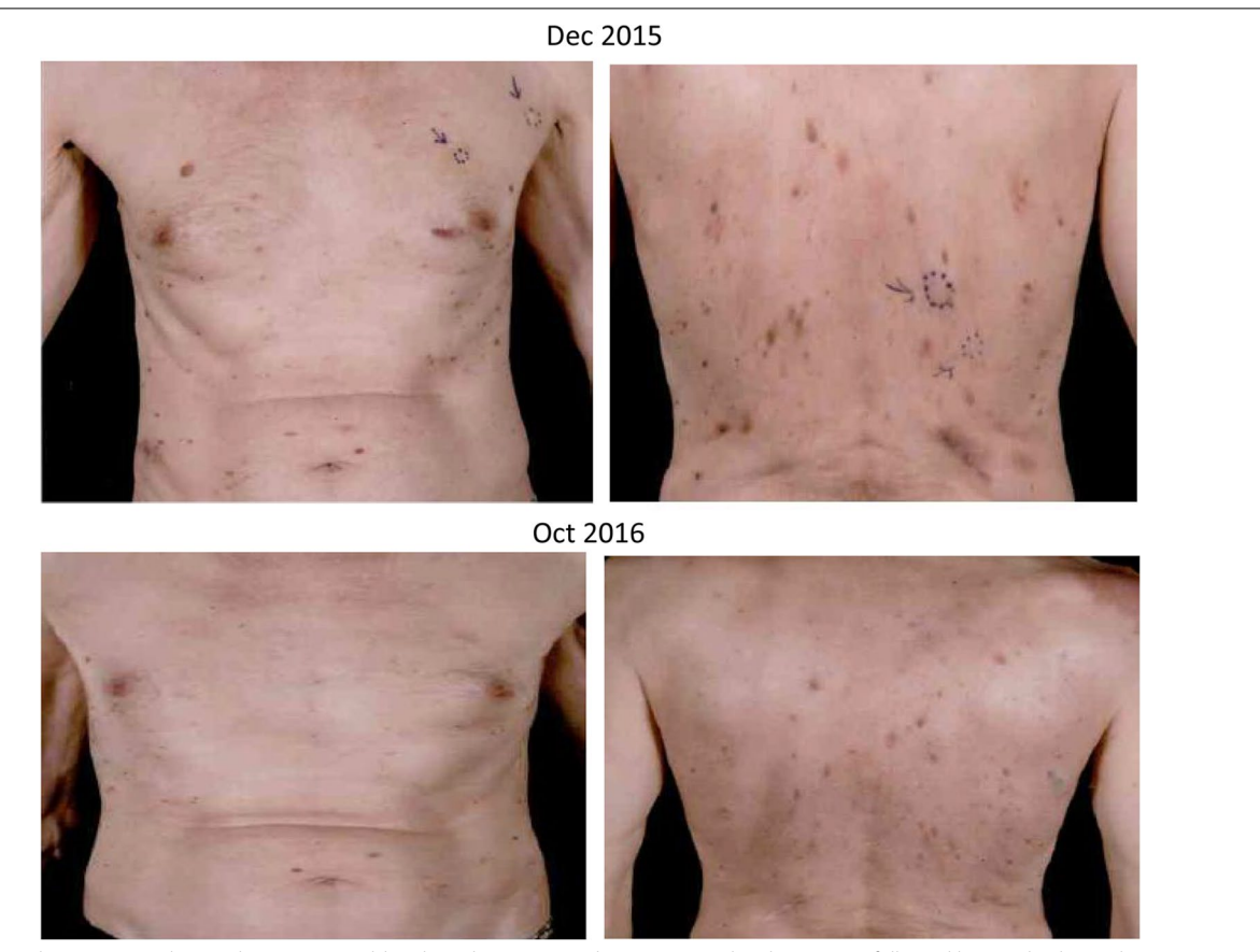
Fig. 2 Complete reponse observed in a 79 year-old male with stage IV melanoma treated with IMM-101 followed by pembrolizumab (subcutaneous disease). The subcutaneous lesions started to shrink within 4 days of the first infusion of pembrolizumab