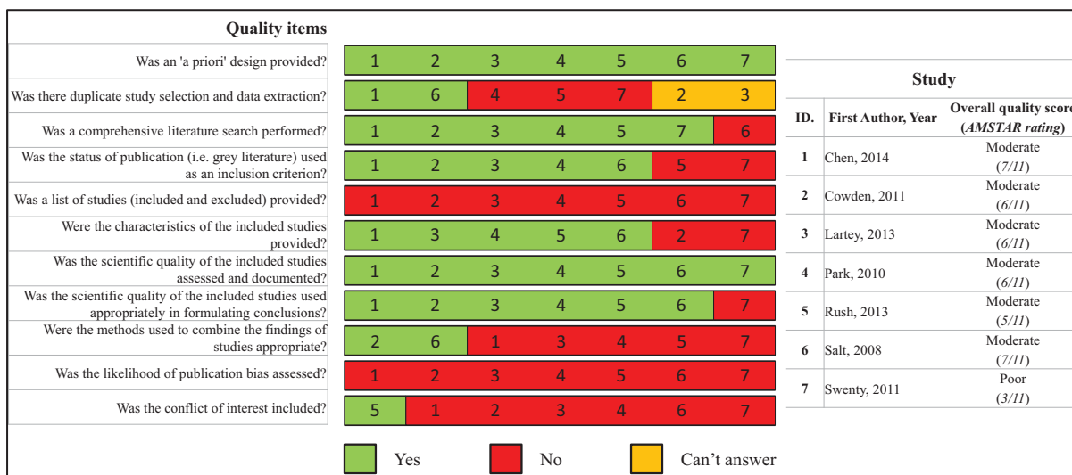
Fig. (2). Graph of the methodological quality of the included reviews, according to AMSTAR quality items.

No reviews received an AMSTAR score of greater than seven, therefore none have been judged to have presented the strongest category of evidence on interventions to reduce turnover. Six of the included reviews were assessed as being of moderate quality, although three [34, 35, 38] received an AMSTAR score of seven at the top of the range in this category. Only one review [35] was failed to be assessed in the strong evidence category on the basis of one AMSTAR quality criteria. These authors comprehensively described the literature sources used but did not report the keywords or search strategy.