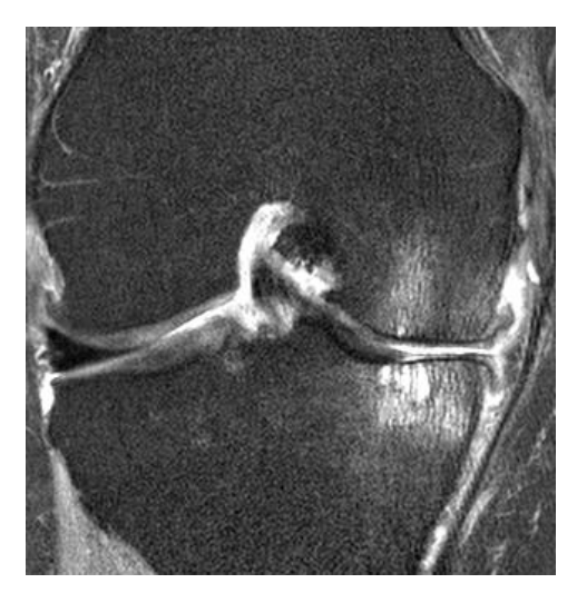
Figure 1. A. MRI showing BML in femur and tibia B. SEM of BML showing cyst and infiltration with cartilage

Results: The mean (SD) total WOMAC scores in the groups were as follows: advanced OA 1436.2 (471.6), early OA 797.4 (549.6) and controls 10.5 (12.6), demonstrating that the advanced OA group had severe pain (p<0.0001).