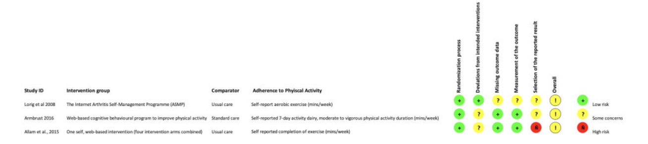
TABLE 2 ROBINS-I risk of bias for included cohort studies