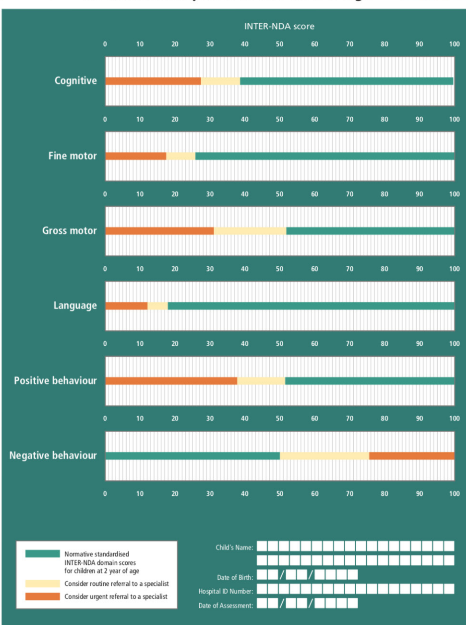
Figure 3 The INTERGROWTH-21st Project international INTER-NDA standards for child development at 2 years of age. INTER-NDA 3rd to 97th centile ranges for 2-year-old children are presented. These are based on scaled INTER-NDA standardised domain scores. Scores falling in the yellow zone correspond to scores between the 10th and 3rd centiles; scores in the orange zone correspond to scores <3rd centile. Clinical judgement should determine whether further developmental assessment is warranted for children with scores in the yellow and orange zones, and the urgency of such referrals. INTER-NDA, INTERGROWTH-21st Neurodevelopment Assessment.