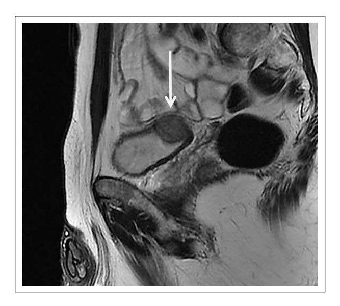
Figure 2. Sagittal T2-weighted MRI image demonstrating an intermediate signal intensity soft tissue mass located in the dome of the bladder (arrow) with an intact bladder wall and no extravesical invasion.

feature. Immunohistochemistry showed the tumour cells to be positive for HMB45 and smooth muscle actin (SMA; Figure 1). The tumour cells were negative for cytokeratins, desmin, Melan-A, Dog-1, CD117, prostate-specific antigen (PSA), CD34, neuroendocrine markers and CD68. Ki-67 proliferation index was less than 10%. The diagnosis of PEComa was made. Excision was recommended, but a period of surveillance was agreed upon after discussion with the patient. A magnetic resonance imaging (MRI) performed 9 months hence showed an increase in tumour size to 28 mm (Figure 2), and the patient subsequently underwent a robotic partial cystectomy, which was performed without complications.