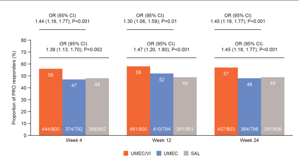
Figure 3 Proportion of patients achieving CII (reaching MCID in at least two PROs) at Weeks 4, 12 and 24<sup>a</sup>.

Notes: <sup>a</sup>Analysis of patients with a responder status for \geq 2 PROs at each visit.