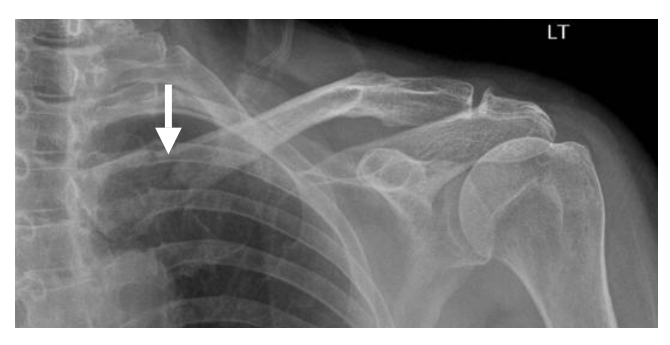
Figure I Plain radiograph of the left shoulder at the first presentation. The radiograph demonstrates a medial clavicular fracture (arrow) that was later diagnosed as pathological.

One week later, the patient was reviewed in the fracture clinic by an orthopaedic registrar who attributed the pain, swelling and the fracture of the clavicle to the mechanism of injury and advised follow-up in one month's time.