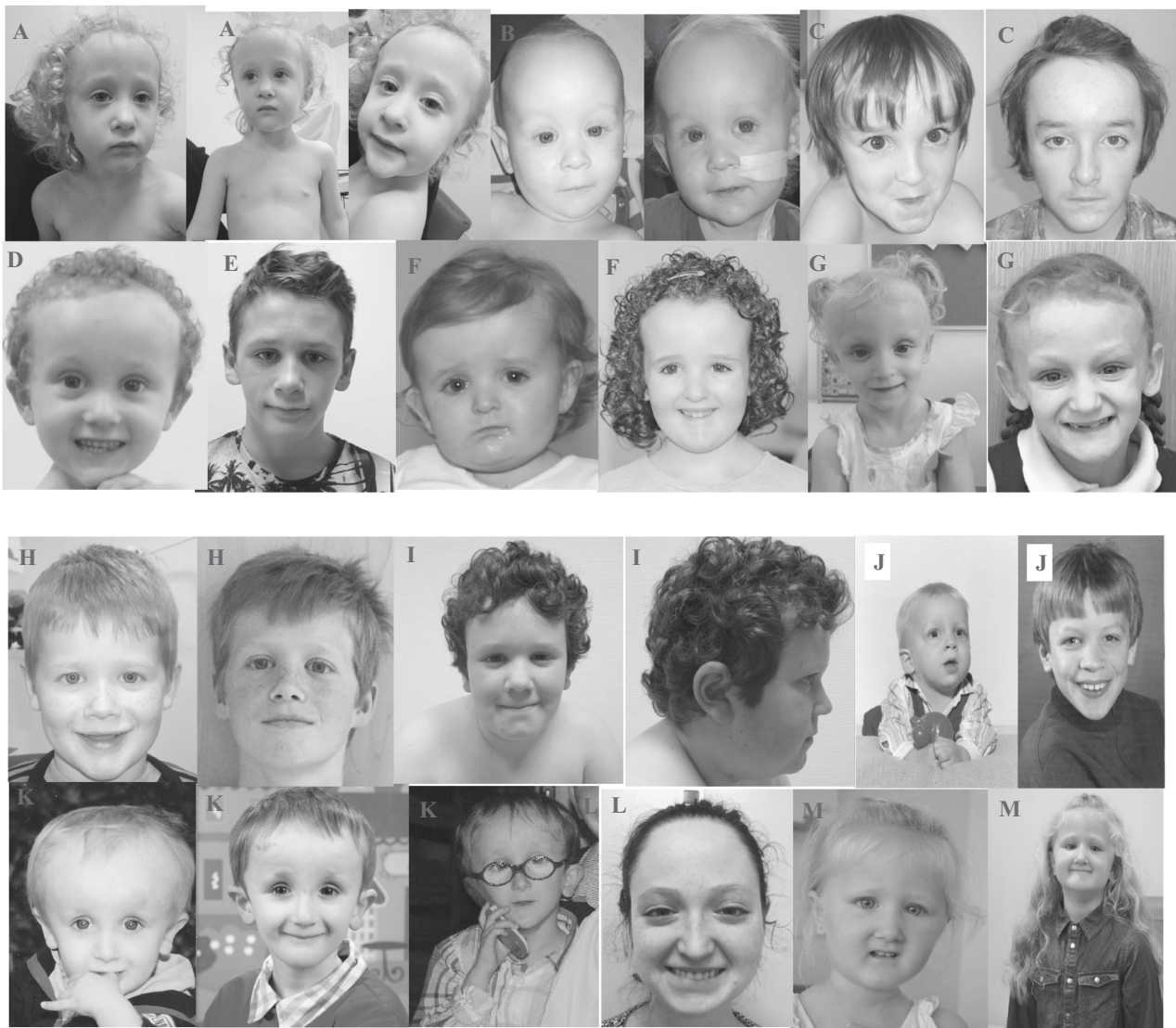
Fig. 1 Characteristic facial appearance of patients with variants in SIN3A. Note the high forehead, small, pointed chin and down-slanting palpebral fissures. A: Patient 1, B Patient 2, C Patient 4, D Patient 5, E

F Patient 9, F Patient 11, G Patient 12, H Patient 13, I Patient 16, J Patient 18, K Patient 25, L Patient 27, M Patient 28.