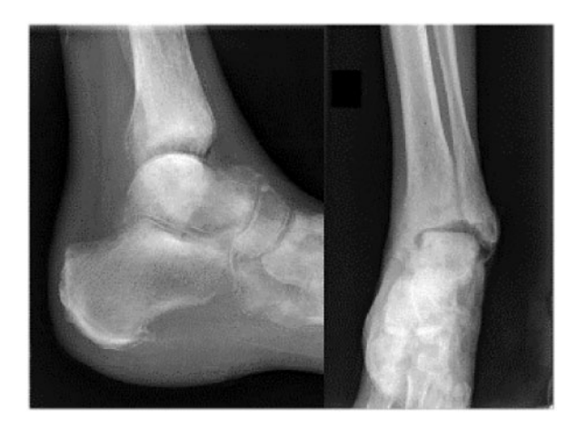
Fig. 3 Septic arthritis of the ankle due to Staphylococcus aureus infection

Plain radiograph showing fuzziness of cortical margins of the distal tibia, fibula and both malleoli.