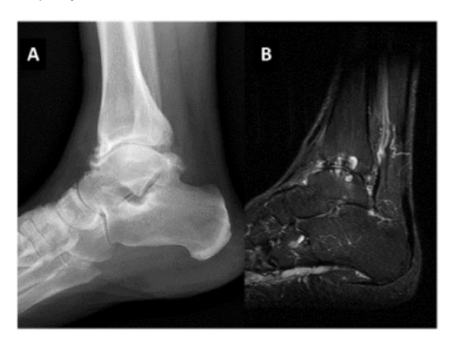
(A) Plain radiograph showing reduced tibio-talar joint space and marginal osteophyte formation. (B) T2 fat suppressed MRI showing periarticular marrow oedema and multiple distal tibia and talar dome subchondral cysts.

20/32 cases (62.5%) and multi variate analysis showed ankle monoarthritis to predict a final diagnosis of peripheral SpA, odds ratio 3.04, 1.13–8.19 [19]. In a French series of 50 patients presenting with <1 year of monoarthritis (excluding septic and crystal arthritis), the ankle was involved in 5 cases (10%) with 2 recovering fully, 2 developing SpA and 1 developing RA [20]. In a UK series of 25 cases of incident ankle monoarthritis, the initial diagnosis was UA in 48%, sarcoid 24% and SpA 12%. Persistent disease developed in 8 cases (32%), with 3 sarcoid, 2 RA, 1 SLE, 1 SpA and I UA [21].