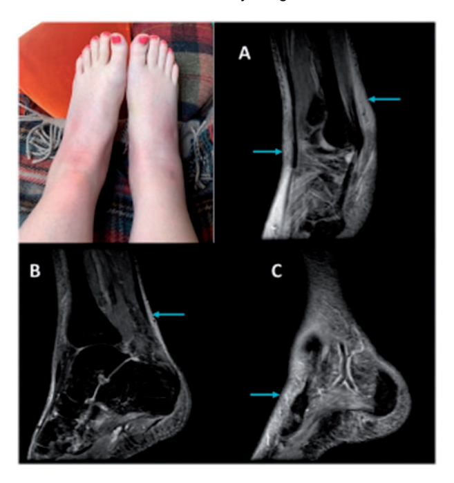
Fig. 4 Lofgren's syndrome clinical and MRI inversion recovery images

Images show (A) lateral, (B) midline and (C) medial sagittal sections of the hind foot with extensive subcutaneous enhancement (arrows) and no ankle joint disease.