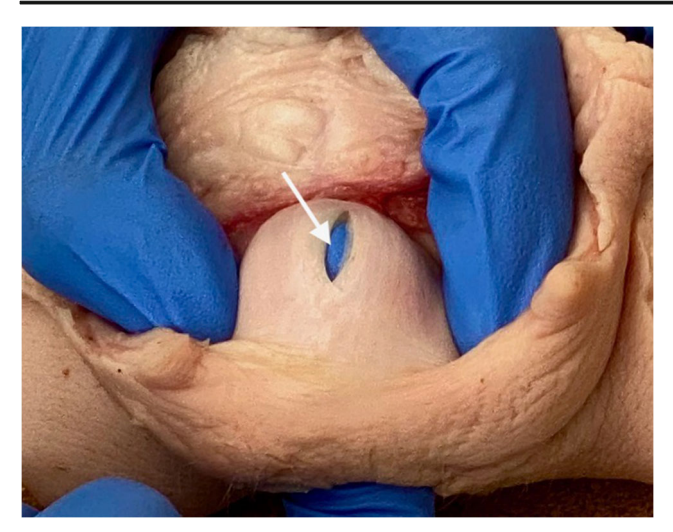
Fig. 2 Isolated rectal buttonhole tear in pig specimen (arrow)

review, Dariane et al. discuss papers describing the embryological origin, microscopic description, anatomical location, relations and function of the rectovaginal septum. They concluded that, present from an embryological stage, it is a distinct connective tissue layer between the vagina and rectum. Its function is likely to be trophic support and compartmentalisation of subperitoneal spaces, limiting expansion of infection and tumours [21]. Given these important functions, and the need for an intermediate layer of tissue to minimise the risk of recurrence, care should be taken to identify and repair the rectovaginal fascia separately.