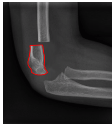
Figure 3: Supracondylar fracture Gartland 3.

The fracture tip – skin distance was also calculated. The medial spike group had a significantly shorter fracture tip-skin distance with significantly more complications than the control group. No difference in preoperative neurovascular status was found.