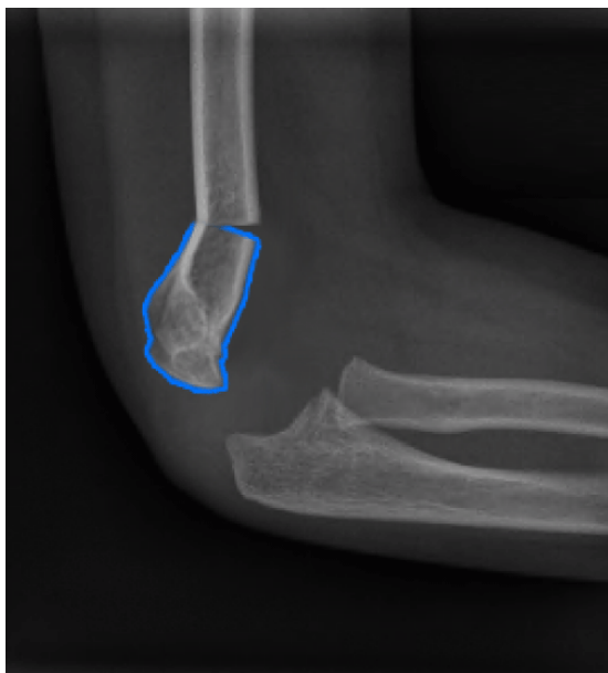
Figure 2: Supracondylar fracture Gartland 2.

Any useful classification system should have strong inter and intra-observer reliability [8], provide basic treatment guidelines, and help to predict outcome. It has been suggested that the Wilkins modification of the Gartland classification showed poor inter-observer reliability for type I fractures, fair to moderate reliability for type II fractures and very good reliability for type III fractures. An analysis by Flierl et al. [9] examined the relationship between coronal fracture displacement and rotational mal-alignment with adverse outcomes. This retrospective review analysed three morphological characteristics on preoperative radiographs from 373 patients. Rotation and coronal displacement patterns were found to be significantly associated with postoperative complications, residual stiffness and nerve injury. The analysis concluded that posterolateral displacement and fractures with rotational deformity were associated with a higher rate of postoperative complications, a greater need for physical or occupational therapy and nerve injury. These findings allow the treating surgeon to anticipate potential complications. Heal et al. [10] also established that treatment should be according to the degree of displacement.