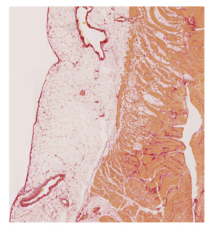
Fig. 1. Histological slide (Picrosirius red stain) of the right ventricular free wall section from a noncardiac death decedent with a structurally normal heart at expert cardiac postmortem.