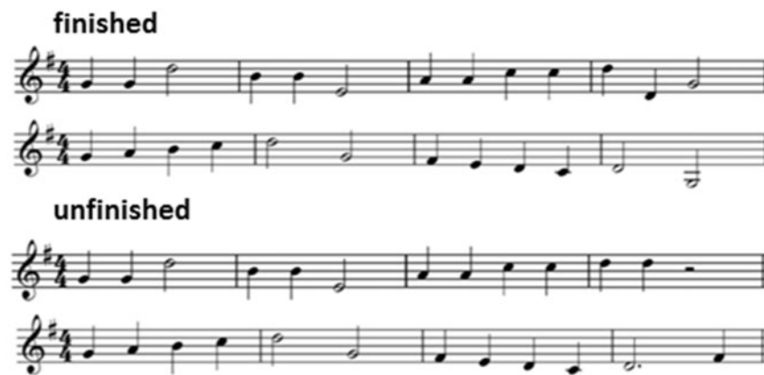
Fig. 1. Examples of stimuli used in the music experimental battery: 'finished' (tonally resolved) and 'unfinished' (tonally unresolved) melodies presented in the tonal (harmonic) expectancy test (see text for further details).

Abbreviated Scale of Intelligence (WASI) Matrices score, an index of overall disease severity] within the patient cohort.