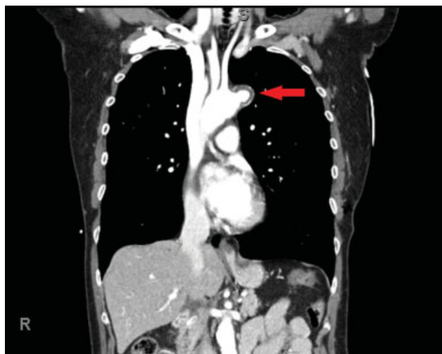
Fig. 1 Computed tomography (CT) aorta showing the pseudoaneurysm.