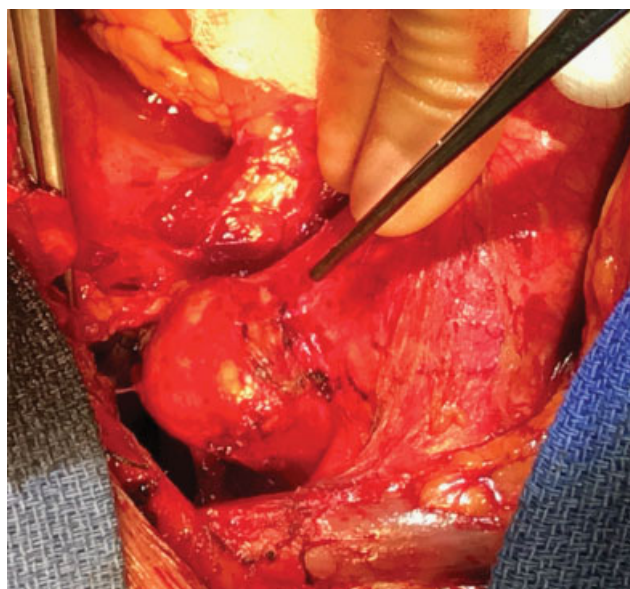
Fig. 2 Operative picture demonstrating the pseudoaneurysm.

A follow-up transthoracic echocardiogram revealed normal biventricular function and a normal sized aortic root.