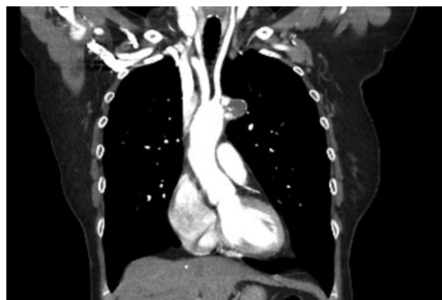
Fig. 4 Follow-up computed tomography (CT) aorta showing no contrast filling into the aneurysm.

invasively while reducing the risks associated with the conventional open aortic approach.