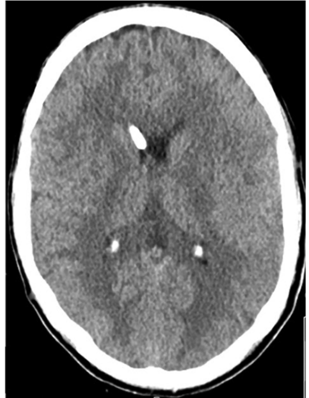
FIG. 2. Illustrative axial CT section obtained in a patient, showing the ipsilateral frontal horn location of the EVD catheter tip.

tems by which to define the optimal position of an EVD catheter tip, 9,12 while others have argued that a misplaced catheter is, by definition, one in which the EVD is non-functional and requires replacement. 3 The observation of CSF flow through an FH-inserted EVD is the only marker of intraoperative success. This in itself is falsely reassuring, as up to 50% of EVD tips have been observed in CSF spaces other than the frontal horn of the lateral ventricle. 16 Indeed, up to 10% of catheter tips are observed to sit within brain parenchyma despite having initially drained CSF following insertion. 16 There is mounting evidence that the use of intraoperative image guidance results in improved accuracy of EVD placement. 4,5,11 Herein, we describe our center-based experience comparing the accuracy, underlying pathology, and complications of both FH and image-guided insertion of frontal EVDs, with a particular focus on cases with small ventricles.