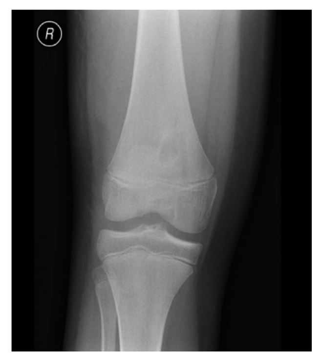
Figure 1: Radiograph on presentation to A + E. The radiograph displays 'a well corticated lesion ( 15 \text{ mm} \times 17 \text{ mm} ) in the distal femur'.