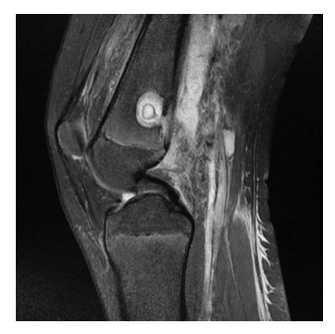
Figure 2: MRI Images on admission to Hospital. MRI images displaying 'osteomyelitis with sequestration and erosion through the posterior cortex, extensively extending into the surrounding soft tissues'.

'A large complex loculated abscess, 10 \text{ cm} \times 8 \times 8 \text{ cm} , extending between the muscles and extended to the posterolateral aspect of the distal femur. A cloaca is present in the cortical bone on the posterior aspect of the distal femur.'