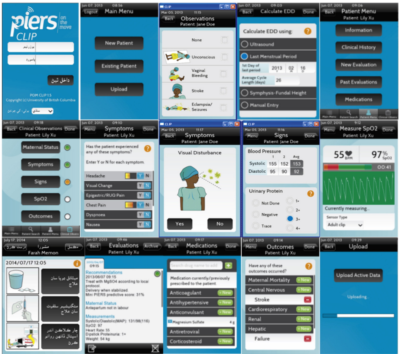
Fig. 2. PIERS on the Move mHealth application screenshots (Nigerian version of pictograms).

Mozambique and Pakistan ( http://pre-empt.cfri.ca/treatment/clip-trial ; accessed November 10, 2014). Within the context of the CLIP Trial, hypertensive women identified within their community to be at greatest risk of maternal complications receive 10 g intramuscular MgSO 4 and, with severe hypertension, oral 750 mg methyldopa prior to urgent referral to a referral facility (i.e. completed referral within four hours). In CLIP intervention clusters, all women identified as being hypertensive are referred to facilities within 24 hours as none is without risk and many will have disease evolution to more severe disease.